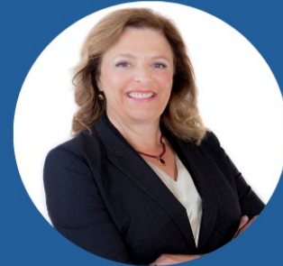
JUDGE CATHERINE MAUZY TRAVIS COUNTY 419TH JUDICIAL DISTRICT "DIVORCE REIMBURSEMENT CLAIMS & EQUITABLE PRINCIPLES"