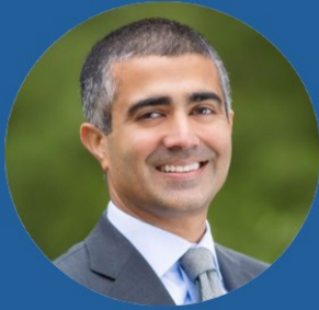
JUDGE VASU BEHARA DEPUTY CHIEF ADMINISTRATIVE LAW JUDGE FOR SOAH "CONTESTED CASES BEFORE ADMINISTRATIVE TRIBUNALS"